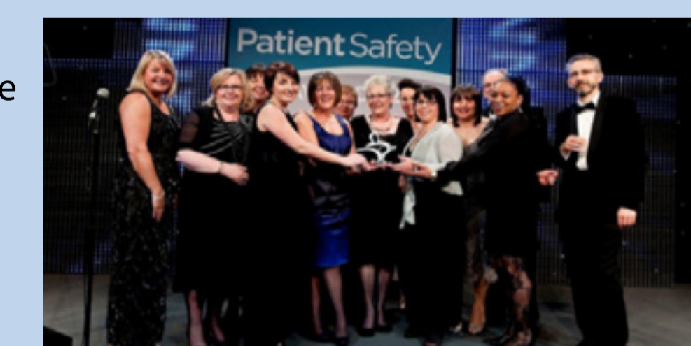
Patient Safety in Primary Care Award Winners 2011

Care Home Managers were invited to sign a pledge of commitment to improving Infection Prevention standards and training year on year in return for the free PREVENT CHARTER package. This would mean the commitment of the PCT through the Infection Prevention Team to provide annual audit and a report and support training via a DVD and invite residents of the care home to have MRSA screening and treatment of residents in six monthly cycles.